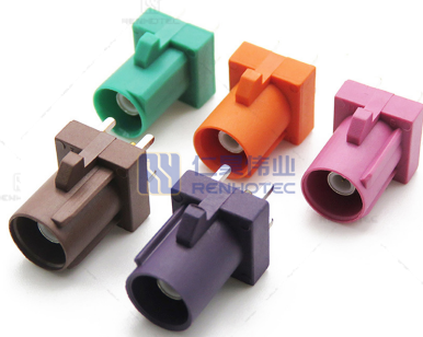
Fakra Short Body Vertical Straight Male A-Z Through Hole